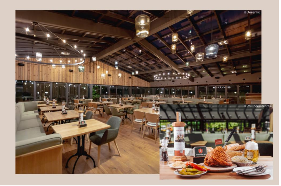
f.l. ©Derenko ©Philipp Lipiarski

This year's TRB ISFO participants can join a Networking dinner at Luftburg. This restaurant does not only serve everything from traditional Viennese cuisine to vegetarian and vegan dishes and drinks in 100% organic quality but is also located in the world famous "Wiener Prater" amusement park.